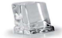
Full Cube - 12 G (26,5 x 26,5 x 26 mm)