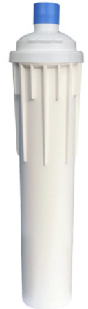
FL 200 FL 222-sediment