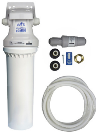
FL 10 Kit Complete FL 100ctg