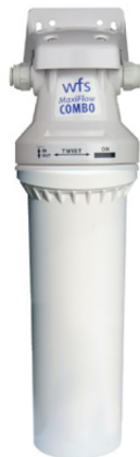
FL 1000 FL 100ctg